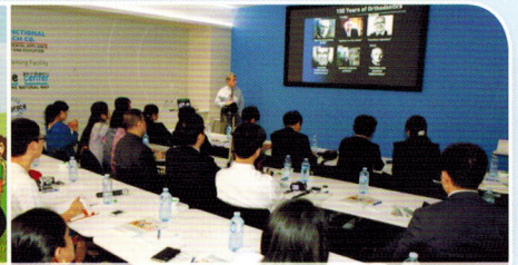
International Training Facilities